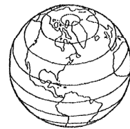
latitude 2a: hemisphere marked with parallels of latitude

lat-tice-work [lā-təs-wɜrk] n (15c) : a lattice or work made of lattices