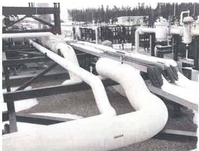
The viscosity of Alberta's heavy oil causes issues in transportation.

The January 2014 startup of TransCanada's Gulf Coast Pipeline Project, originally the southern leg of the delayed Keystone XL pipeline extending from Oklahoma through Texas, promises easier access to heavy Canadian crudes for Gulf Coast refiners. Canadian crude imports into the Gulf Coast hit an all-time high of nearly 6.2 MMbbl in June 2012, according to the EIA. As more of this heavy crude enters the U.S., technologies such as the new heavy oil DRA will be a vitally