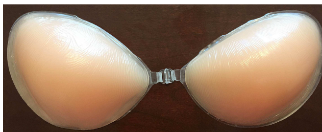
Bragel's Nubra Product

A POSITA would understand that there was a nexus between the claimed invention and the commercial success. Ex. 2001, ¶119. The Nubra product is a backless, strapless breast form system to be worn in place of a traditional bra, as claimed in the asserted claims, and it meets all the limitations of the asserted claims. Id. Further, the NuBra product embodies the three benefits of the claimed invention described above. Id. The NuBra product is designed to enhance the size and shape of the wearer's bustline, is designed to be natural looking and natural feeling to the wearer, and eliminates the need for using a traditional bra such that NuBra can be worn with a full range of women's clothing. Id. A picture of the Nubra product is shown below: