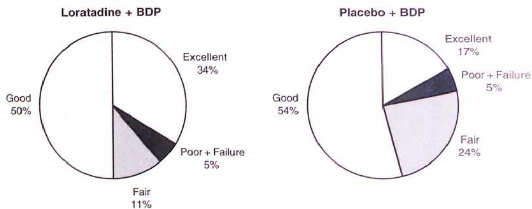
Fig 2. Physicians' global evaluation at endpoint.*