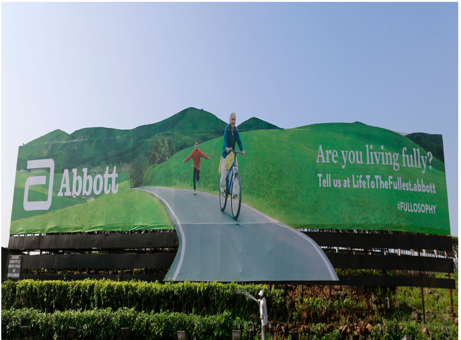
SIDE ROAD: A billboard for Abbott in Mumbai. The American pharmaceutical company and hundreds of other firms in India are selling drugs that have been approved by a state but not by the central government.