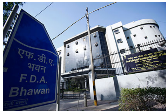
ANOTHER CHANCE: India's drugs chief, whose office is located at the food and drug administration building in New Delhi, says he has to give manufacturers a chance to prove that drugs currently being sold without the approval of his office are safe.