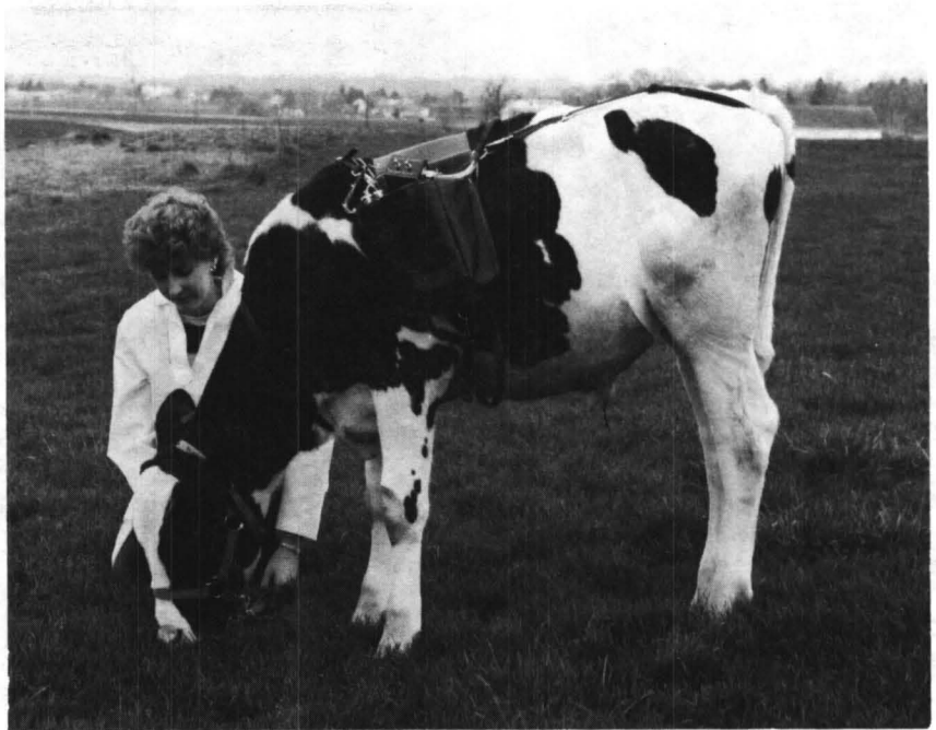
Figure 3. "E.T." A calf with the implanted electric motor-driven total artificial heart. The technician is holding the electronics and a small NiCd battery pack. This animal has survived 114 days (May 1983) and is in excellent health.