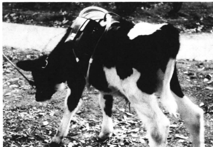
Figure 1. "Magic" with the Jarvik-7 artificial heart and Heimes portable driver.