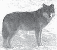
wolf Tundra wolf Canis lupus tundarum

with·er·shins (wĭth'ər-shĭnz') adv. Var. of widdershins . With·er·spoon (wĭth'ər-spōon'), John . 1723–94. Scottish-born Amer. cleric and Revolutionary leader who was a signer of the Declaration of Independence.