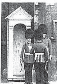
sentry box At Saint James's Palace, London