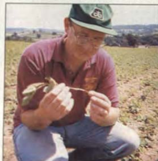
Trial trail... Canadian soya bean breeders are on the trail of varieties that will succeed in Britain as growing trials take place on nine sites around the UK p62.