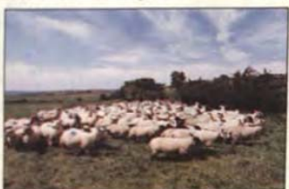
All change... Management changes have more than halved lamb mortality figures as best practice has boosted flock performance on a MAFF-funded project on a south Devon farm p49.