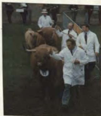
Highland highs... Not even football could lower the spirits at the livestock, machinery and technical events at this year's Royal Highland Show. Reports start on p42.