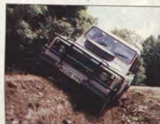
On course... Polishing up skills in off-road driving is one of the more unusual courses featured in our in-depth guide to what's on offer in agricultural education and training p96.