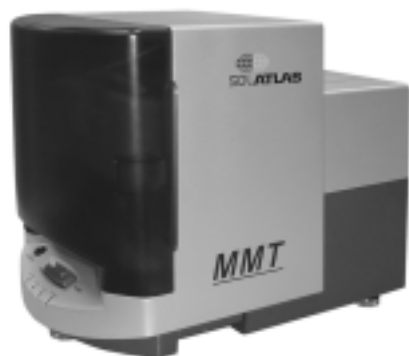
Fig. 1—Moisture management tester.