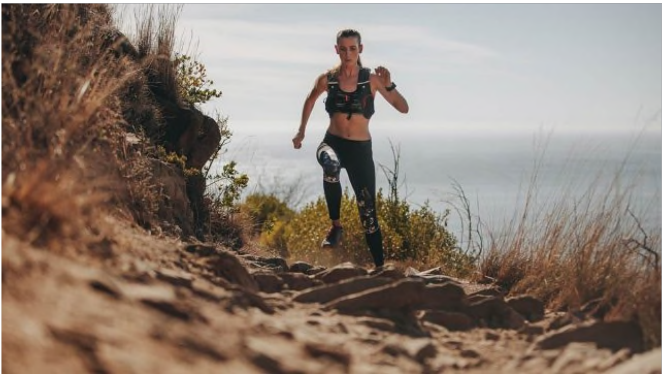
Trail Running Basics for Newbies