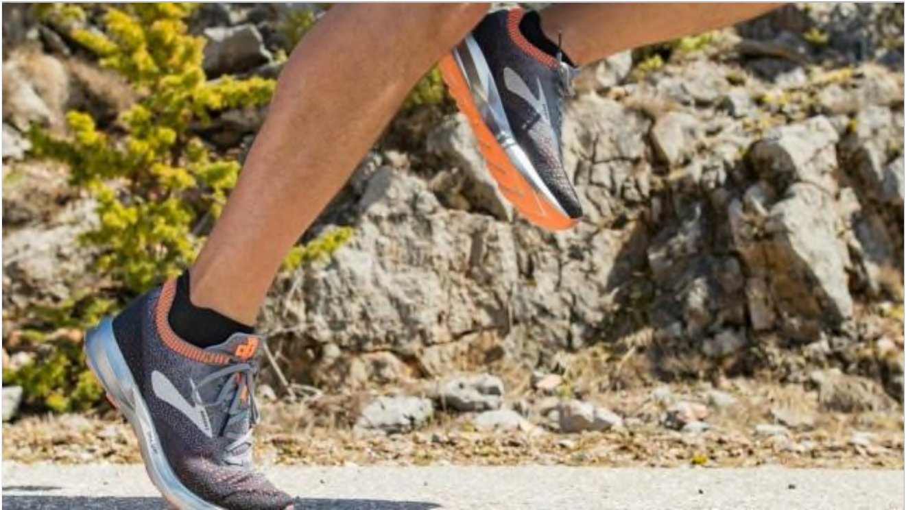
Behind the Shoe: Brooks Levitate