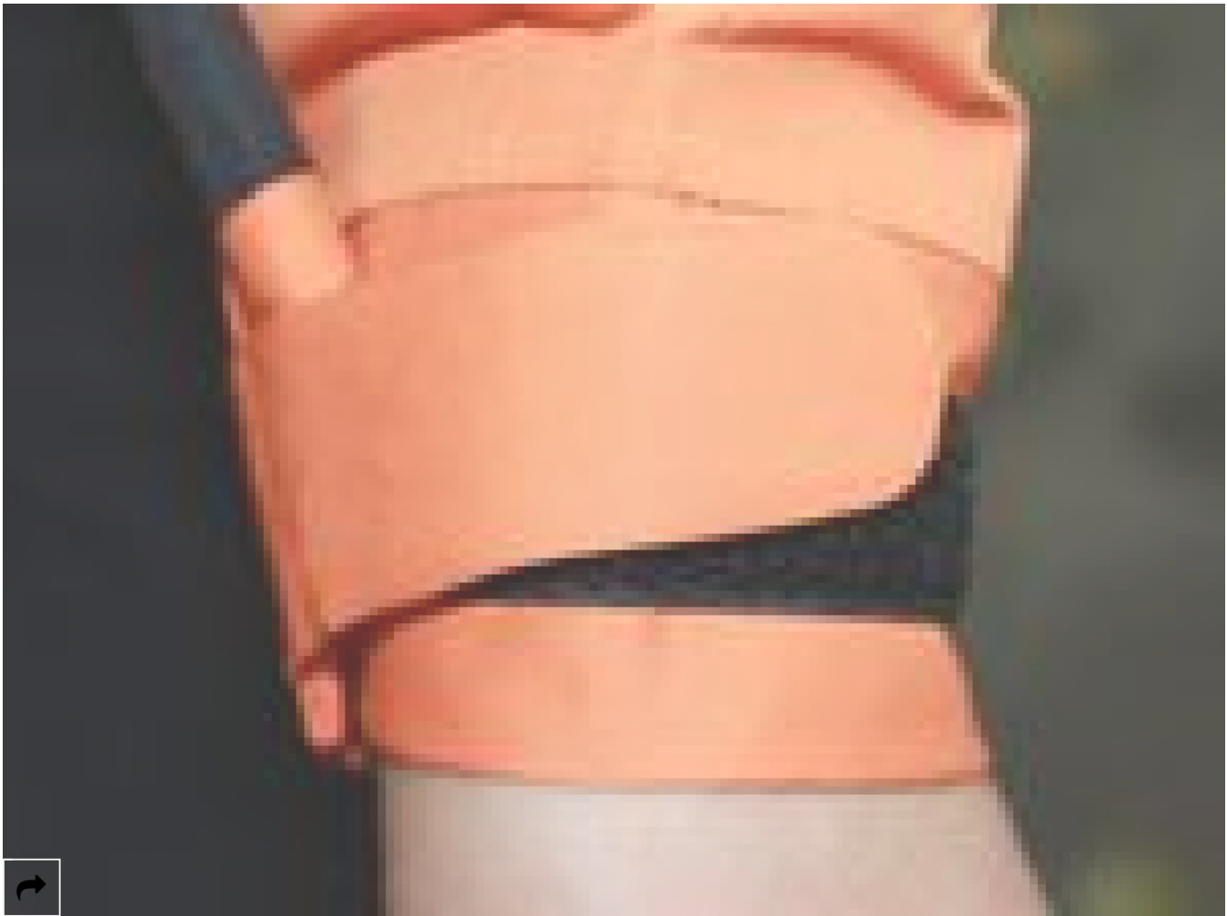
Velcro cuffs seal out the weather.

There's a waterproof zip on the chest pocket and a headphone port for your mp3 player (but keep the volume down so you can still hear the traffic eh.) Reflective stripes on the arms and back boost visibility.