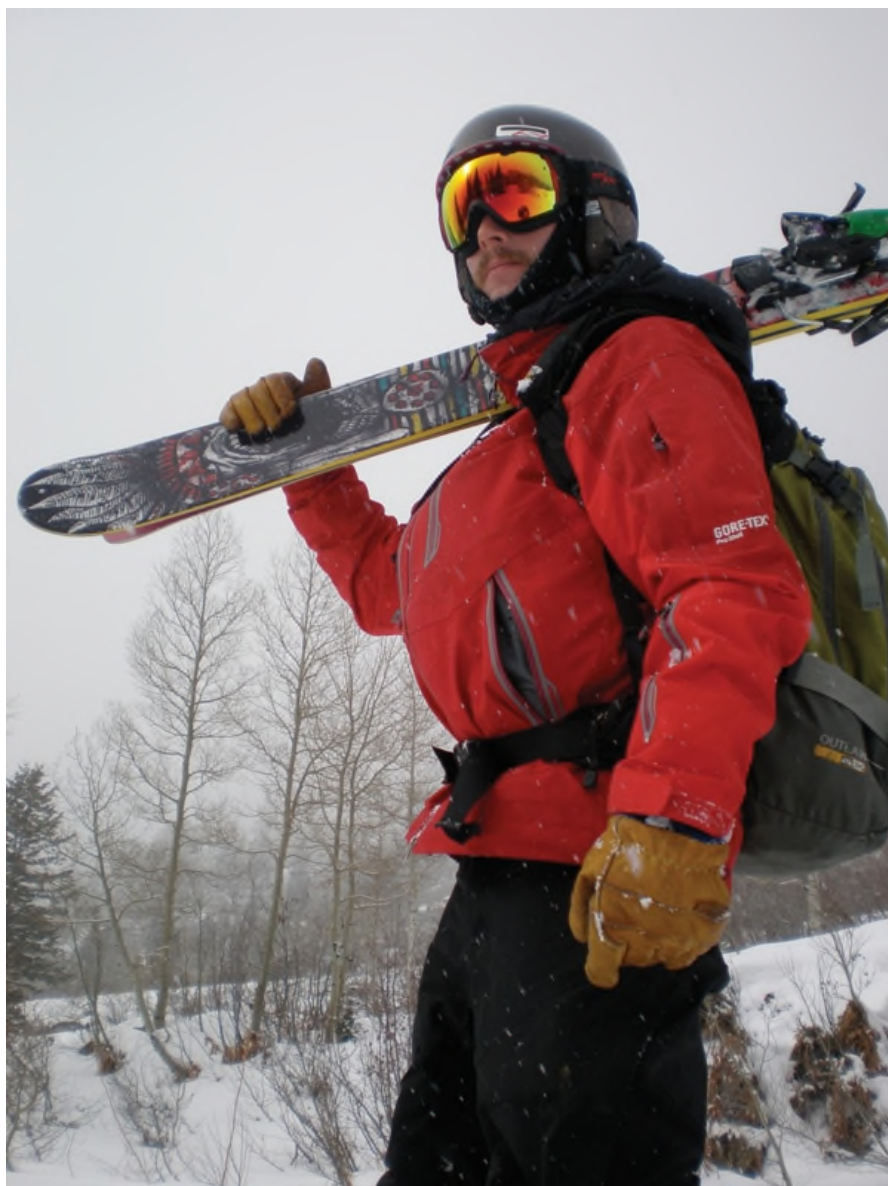
4FRNT YLE 177 Skis