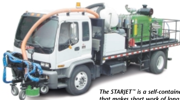
The STARJET™ is a self-contained system that makes short work of long runs.

The driver operates the STARJET™ as he drives, occasionally leaning out the window to monitor progress.