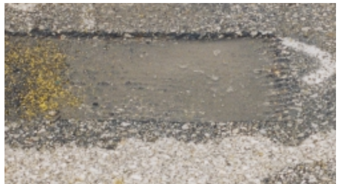
Grinding can leave ruts in the pavement as well as traces of striping.