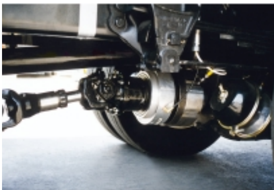
NLB's hydrostatic drive maintains a constant speed for stripe removal. It is disengaged to return the truck to normal driving mode.