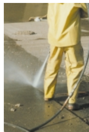
For close work, like expansion joint removal, water jetting can be done by hand.