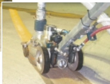
Hard rubber wheels accommodate a variety of surfaces.