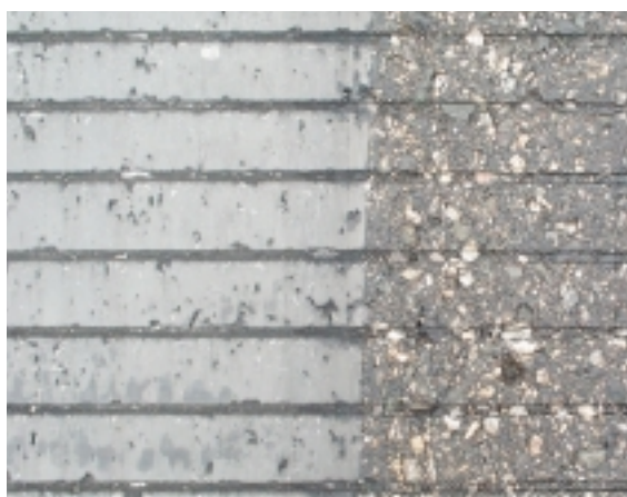
Remove runway rubber with a STARJET™ or STRIPEJET™.