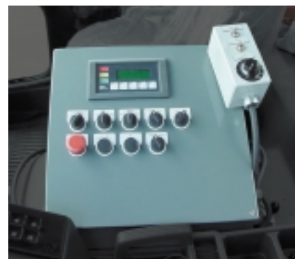
Controls are simple and conveniently located.