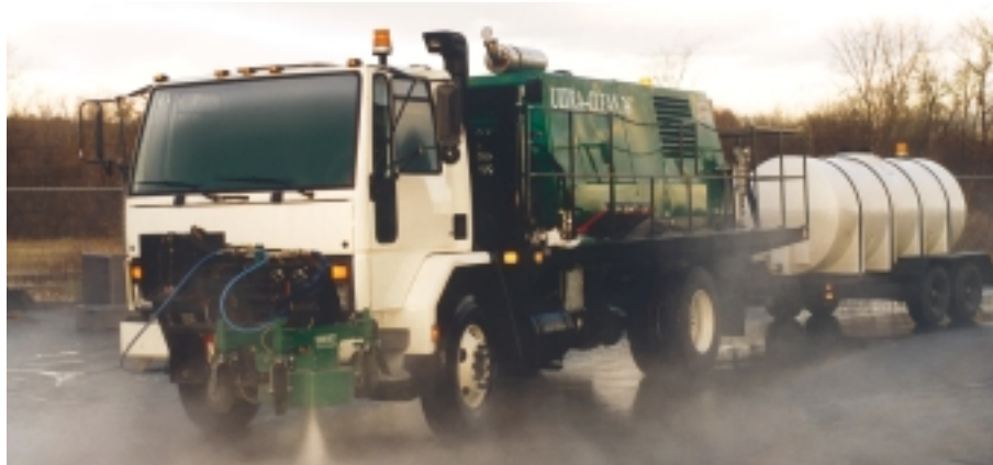
A patented nozzle assembly is mounted to the bumper of the truck, which transports the pump and vacuum recovery (optional), and tows the water supply.