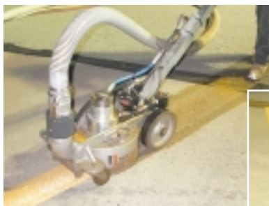
The VORTEX™ is lightweight (138 lbs.) and features vacuum recovery.

The VORTEX™ model 36-9950-15A is ideal for jobs that are too big to do manually, yet can't justify automated water jetting. NLB's patented SPIN JET® technology removes pavement markings, floor coatings (thick or thin films) or runway rubber build-up at rates up to 2,000 square feet per hour while an operator simply walks behind the unit.