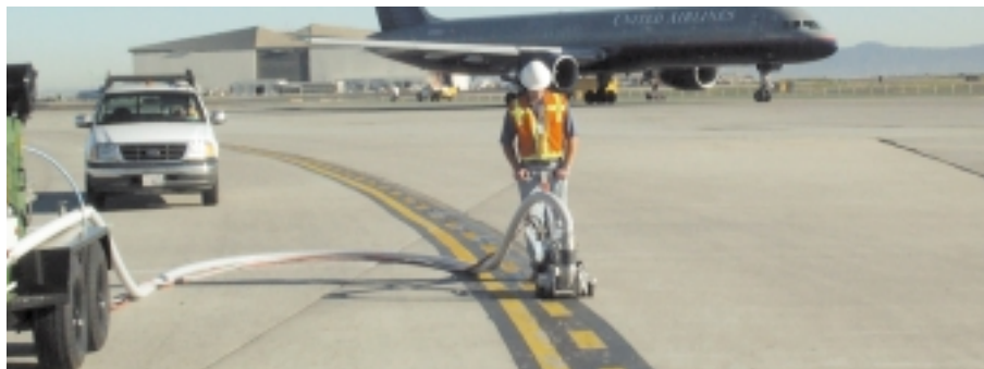
A VORTEX® quickly removes pavement markings from runways, and includes vacuum recovery to simplify clean-up.