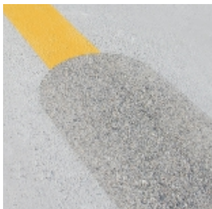
In one pass, most markings are completely removed and the surface is prepared for recoating.