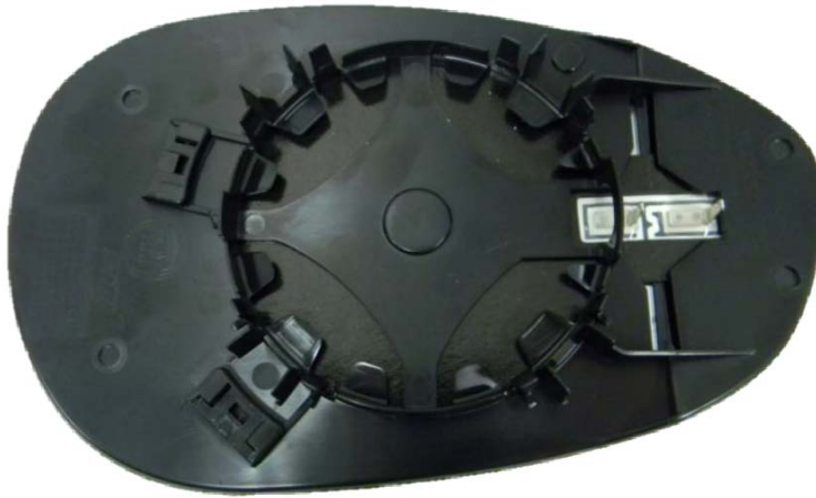
Figure 19 – SMR Fiat 500 Backing Plate

48. The SMR defendants are part of a sophisticated family of companies that is aware of the intellectual property rights of others in the relevant automotive industry. Upon information and belief, SMR regularly conducts searches for patents related to its products. Also based upon information and belief, and as reflected on the USPTO website http://patft.uspto.gov/netacgi/nph-Parser?Sect1=PTO2&Sect2=HITOFF&u=%2Fmetahtml%2FPTO%2Fsearch-adv.htm&r=0&f=S&l=50&d=PTXT&p=2&S1=((smr.ASNM.+NOT+corporation.ASNM.)+NOT+inc.ASNM.)&Page=Next&OS=an/smr+andnot+an/corporation+andnot+an/inc&RS=((AN/smr+ANDNOT+AN/corporation)+ANDNOT+AN/inc) , SMR has secured