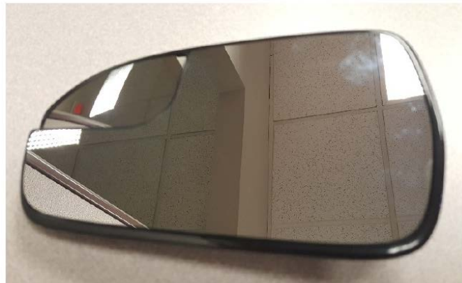
Figure 4 – SMR Ford Fusion Reflective Elements