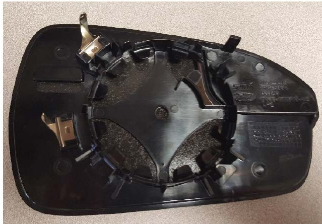
Figure 6 – SMR Ford Fusion Backing Plate