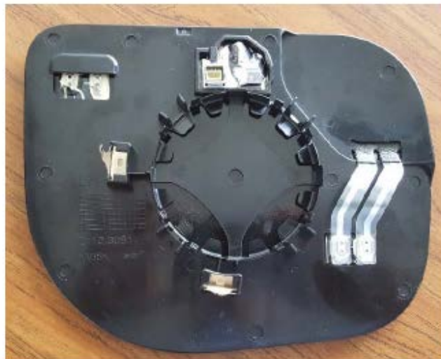
Figure 9 – SMR Nissan Titan Backing Plate