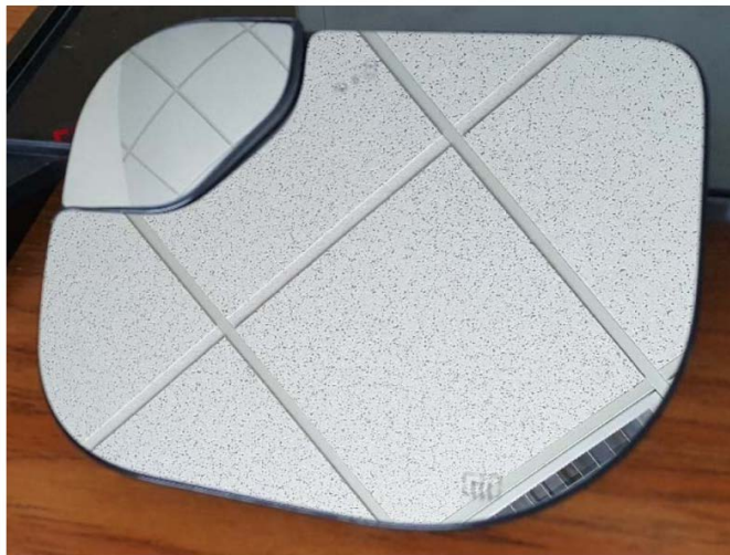
Figure 7 – SMR Nissan Titan Reflective Elements