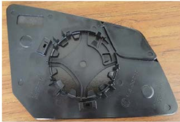
Figure 13 – SMR Traverse Backing Plate