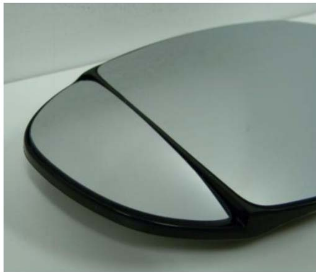
Figure 18 – SMR Fiat 500 Reflective Elements