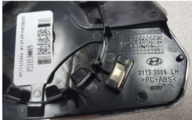
Figure 3 – SMR Hyundai Sonata Backing Plate