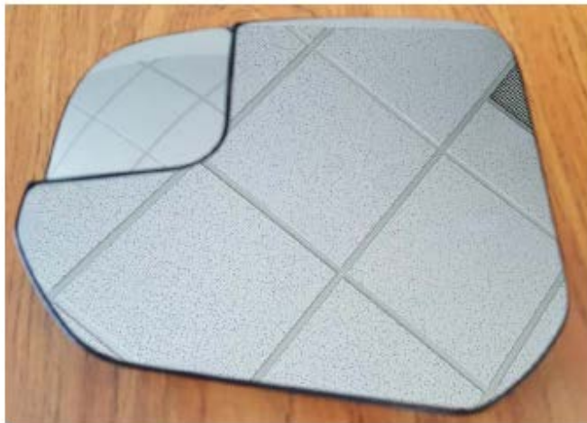
Figure 14 - SMR Ford Transit Connect Reflective Elements