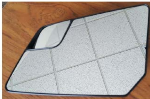
Figure 11 – SMR Traverse Reflective Elements