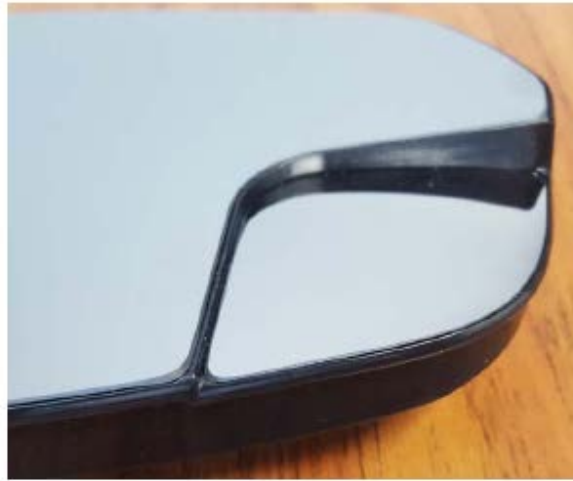
Figure 15 – SMR Ford Transit Connective Reflective Elements