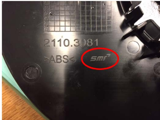
Figure 10 – SMR Nissan Titan Backing Plate