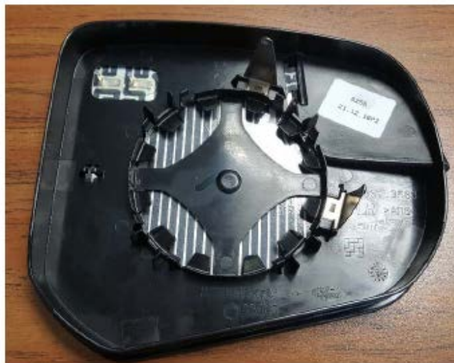
Figure 16 - SMR Ford Transit Connective Backing Plate