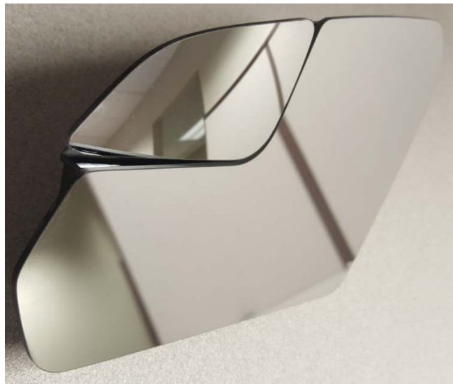
Figure 1 – SMR Hyundai Sonata Reflective Elements

47. Based upon information and belief, the SMR Defendants design, engineer, make, validate, use, cause to be used, sell, offer to sell, cause to be imported, and/or import in and into the United States automotive exterior rearview mirror systems incorporating auxiliary curved mirror reflective elements, and assemblies and components thereof, including the Accused Products (including but not limited to the mirror reflective elements in Figs. 1-19 below) that embody one or more claims of each of the Patents-in-Suit, and SMR will continue to do so unless enjoined by this Court.