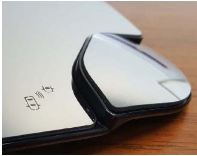
Figure 8 - SMR Nissan Titan Reflective Elements