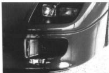
5.19 Front spoiler of Ferrari F40 in a polyurethane integral skin system.