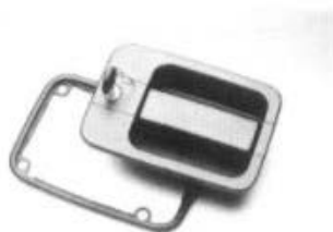
5.21 Iveco truck cab handle in acetal homopolymer.

Exterior door handles need the same kind of properties as mirror housings. Glass reinforced nylon is popular in Europe; however glass reinforced PBT and polyarylamide are used for certain Ford, Peugeot and Volvo models, and acetal homopolymer for some truck cab handles (see Fig. 5.21). Initial