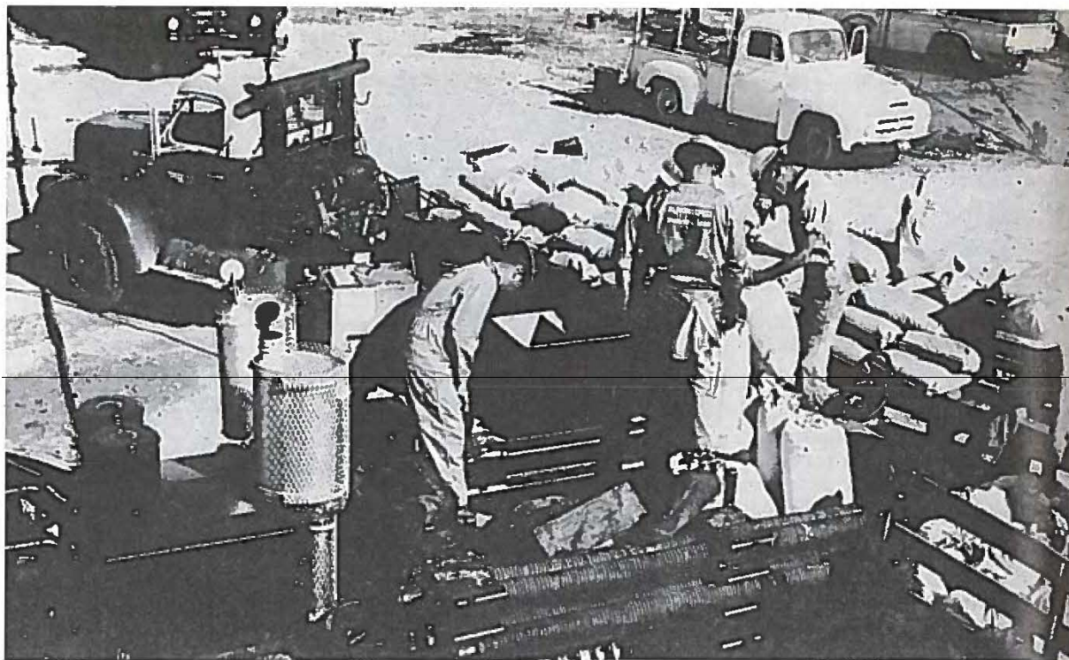
UNIBEADS, delivered to the well in sacks, are added to fluid in a California multistage fracturing job.