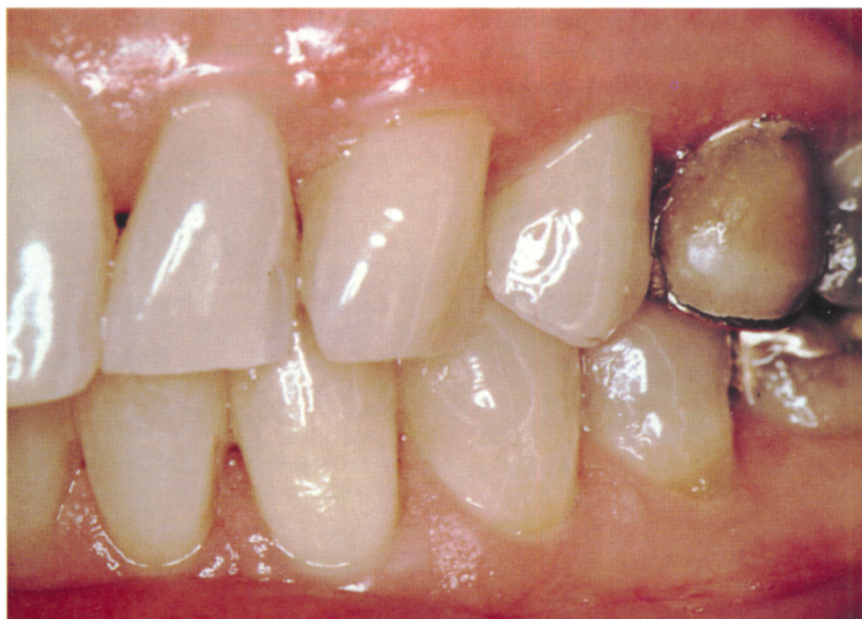
Fig. 3. Natural dentition with translucent, low-value, gray-toned teeth matched with veneered Dicor crown on maxillary canine and lateral incisor.