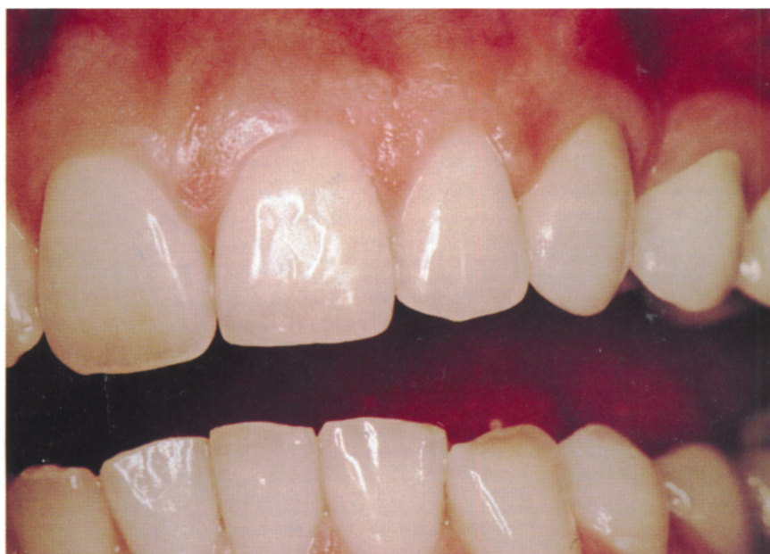
Fig. 4. Natural dentition with less translucency, higher value, average color content matched with an In-Ceram crown on maxillary canine.

torations. However, problems with shading in the gingival third of restorations may develop because of the high reflectivity of core materials and thin veneer. In these instances, framework modification should be considered to allow a more natural light transmittance, including potential contributions from an "internal luminance" optical effect. Teeth that are higher in value with more color content, as in Vita shades A-3 to A-4, are most suitably