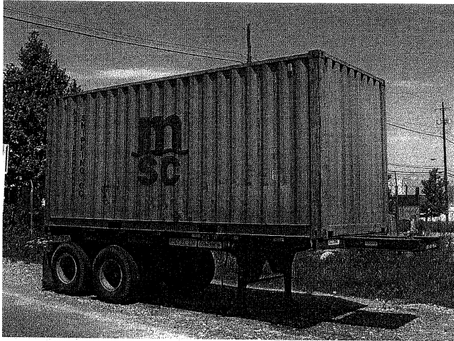
► Figure 3-3 This seemingly small truck trailer represents the basic unit of containerization. It is a 20-foot container owned by the Mediterranean Shipping Company, the second largest containership operator. The carrying capacity of containerships is typically expressed in units known as TEUs (20-foot equivalent units). A ship that can accommodate 9,000 TEUs can thus handle this container ... plus 8,999 just like it.

the maximum length of trailers permitted on public highways throughout the United States and which can be accommodated aboard container-carrying railroad cars. The below-deck cells of most seagoing containerships will not accommodate 53-foot boxes, but they have proven popular with companies that specialize in moving containers aboard barges. For example, containers on barges play a major role in cargo service between mainland ports, like Jacksonville and Miami in Florida, and the island Commonwealth of Puerto Rico.