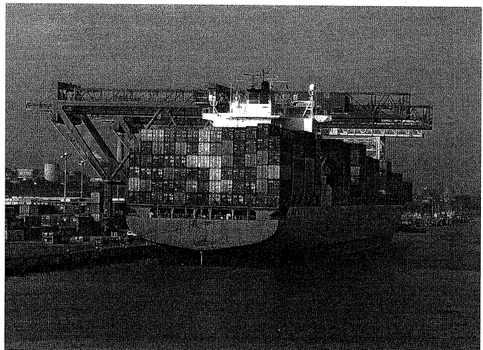
► Figure 3-1 The COSCO containership Feihe is docked in the port of Boston, adjacent to shoreside gantry cranes that load and unload the vessel's containers.

On April 26, 1966, Sea-Land officials held a quiet celebration at the company's New Jersey headquarters to mark the tenth anniversary of the inaugural voyage of Ideal X . But on that same day, something even more remarkable was taking place. One of Gateway City's sister ships, a converted C-2 cargo vessel that bore the name Fairland , was off Cape Race, Newfoundland, steaming eastward across the Atlantic, bound for Rotterdam. What had begun a decade earlier as a modest effort to reinvigorate domestic