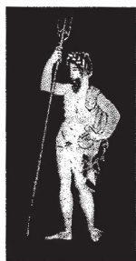
trident Detail of a bell crater showing Poseidon holding a trident