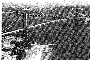
Verrazano-Narrows Bridge, New York City, an example of a suspension bridge. (Triborough Bridge and Tunnel Authority)