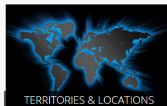
TERRITORIES &amp; LOCATIONS