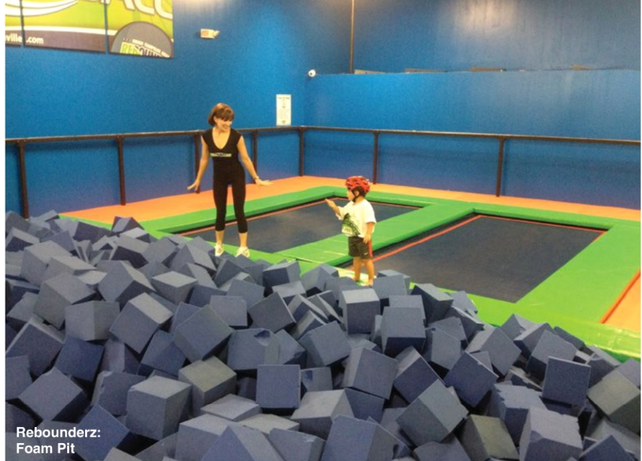
Rebounderz: Foam Pit

Sky Zone was the pioneer in indoor trampoline parks, but it didn't take long for other independently owned parks and new franchise brands to start springing up all over the U.S. and beyond.