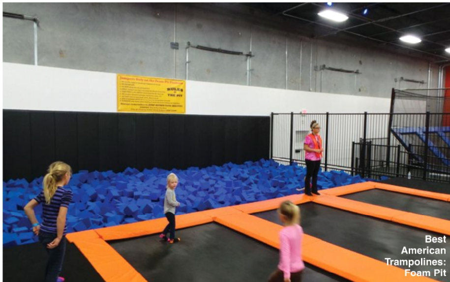
Best American Trampolines: Foam Pit

“The (trampoline) industry as a whole seems to echo the same idea of safe, healthy, family fun and fitness.”