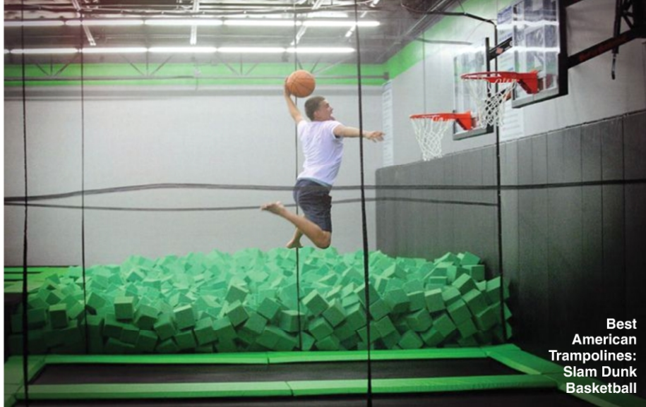
Best American Trampolines: Slam Dunk Basketball

40,000-square-foot facility offers a state-of-the-art “Call of Duty” style laser tag attraction, archery tag, mini-bowling, five themed event rooms, and a video arcade, all of which can be reserved for groups or special events as well as open play. It also offers a full-service cafe with pizza, subs, and other food items as well as wine and beer for non-participating guests.