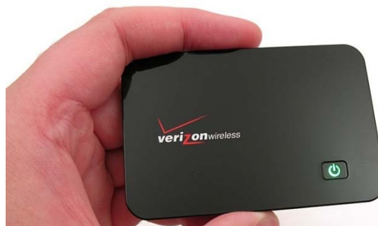
Photo of MiFi2200

The accused products in this case are small, portable, electronic “MiFi” (Mobile Wi-Fi or My Wi-Fi) devices designed, manufactured, imported and sold by Novatel, and sold at retail to consumers together with cell network access by Verizon/Cellco. Carucel accuses five different MiFi product models of infringing each Carucel patent. The accused MiFi models are the: MiFi2200, MiFi4510, MiFi4620, MiFi5510, and MiFi6620. A representative photo of the MiFi2200 is shown below.