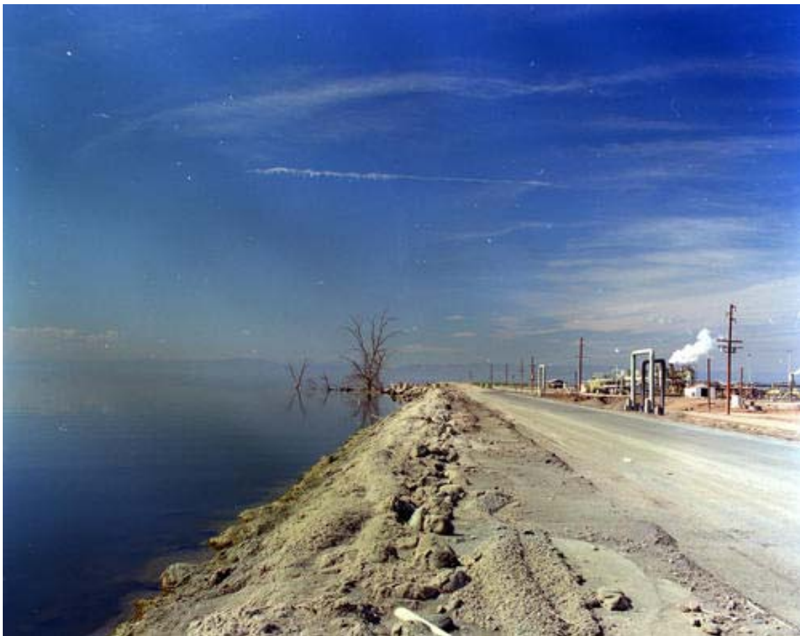
Figure 2. CalEnergy's geothermal power production facility near shore of Salton Sea in the Imperial Valley of southern California.

Silica must be removed from the fluid for the zinc extraction process to be successful. If not, the ion exchange resins are quickly covered by silica precipitates and fail to efficiently extract zinc. The silica is currently removed upstream using a clarification process that combines lime addition and silica seeding. The pH increase accompanying lime addition accelerates silica polymerization, and silica seeds enhance precipitation. The silica is removed by flocculant-aided settling. The silica precipitated with this method has significant amounts of contaminants such as iron and calcium that make it unsuitable for many silica markets for which high purity is needed. Tests showed that it had some favorable properties for use as a cement additive. Currently the silica is being disposed of in a nearby landfill.