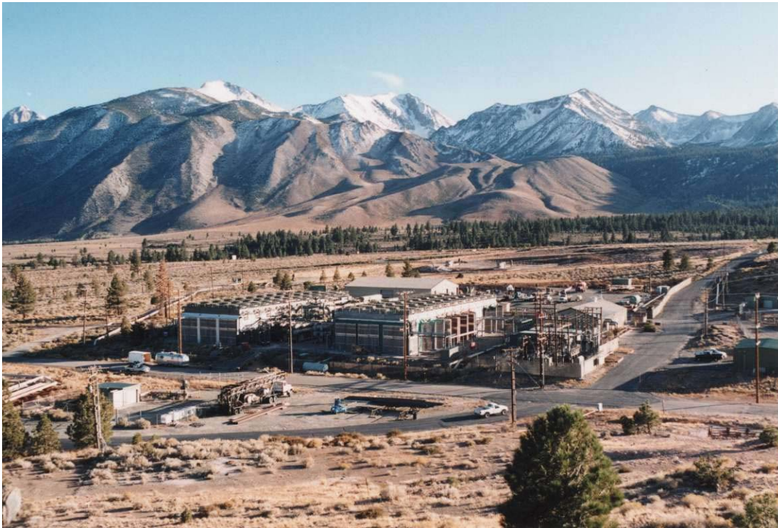
Figure 3. Mammoth Pacific L.P.'s geothermal power production plant near Mammoth Lakes, California where silica extraction R&D is currently being carried out.

Current work is underway to extract silica at the Mammoth Lakes, California geothermal plant (Figure 3), with major R&D sponsorship by the U.S. Department of Energy Geothermal Technologies Program through Lawrence Livermore National Laboratory, the California Energy Commission, and Mammoth Pacific L.P. The geothermal fluid at Mammoth has one of the lowest salinities of any geothermal fluid (1200 ppm TDS), with very low calcium, and negligible iron and other metals content. For this reason, the co-produced silica is of very high purity, and therefore may be useful in markets where high purity is necessary, such as colloidal silica for silicon chip polishing.