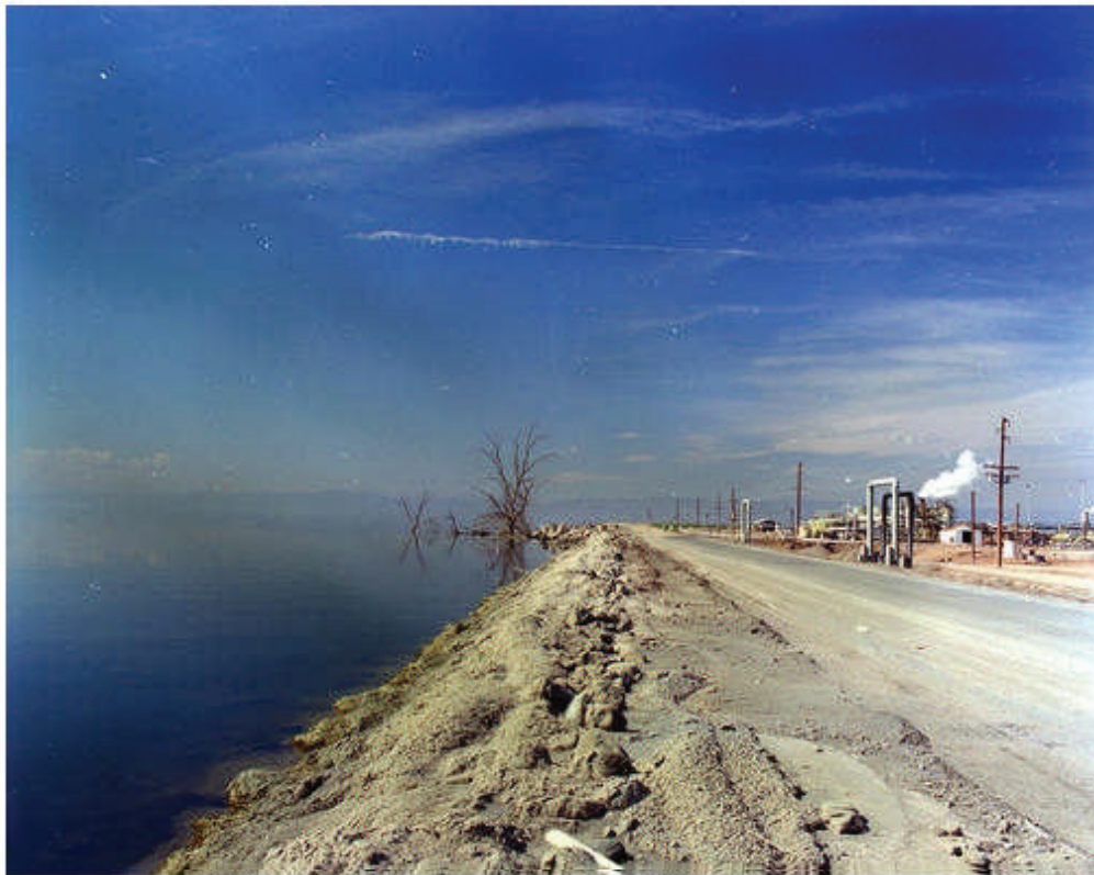
Figure 2. CalEnergy's geothermal power production facility near shore of Salton Sea in the Imperial Valley of southern California.

Silica must be removed from the fluid for the zinc extraction process to be successful. If not, the ion exchange resins are quickly covered by silica precipitates and fail to efficiently extract zinc. The silica is currently removed upstream using a clarification process that combines lime addition and silica seeding. The pH increase accompanying lime addition accelerates silica polymerization, and silica seeds enhance precipitation. The silica is removed by flocculant-aided settling. The silica precipitated with this method has significant amounts of contaminants such as iron and calcium that make it unsuitable for many silica markets for which high purity is needed. Tests showed that it had some favorable properties for use as a cement additive. Currently the silica is being disposed of in a nearby landfill.