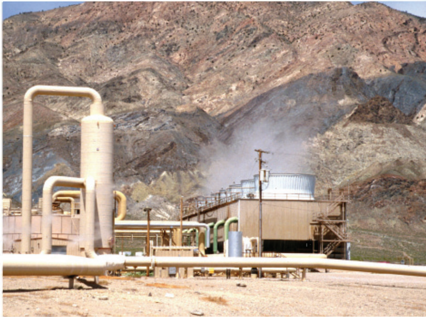
Figure 5. Geothermal power plant at Dixie Valley, Nevada, U.S. where a pilot-scale silica extraction process is in operation.

An economic analysis of silica production at the Dixie Valley geothermal site indicates the following. Capital costs including equipment and building are about $7.8 million. Annual operating costs including labor, power and chemicals are estimated at $3.1 million for a 6,000 ton/year plant. Annual sales at $0.60/lb would yield $7.2 million in sales. After amortization costs, the yield from this project would be equivalent to $0.0094 per kWh produced. In addition, the savings from scale reduction are estimated to be $0.0015 per kWh in terms of annual maintenance and repairs. The total benefit of silica production is equivalent to $0.011 per kWh (1.1 cents/kWh). The pay back period will be less than 3 years based on a 10% interest rate. Market analysis (Moskovitz, 2002) assumes that this is a base case model and that silica sales would far exceed this estimate.