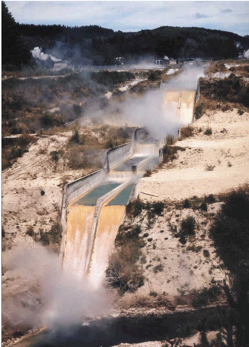
Figure 1. Geothermal fluid drain at Wairakei, New Zealand geothermal site. Silica precipitates of orange-brown color line the channels. A bluish color indicates the presence of colloidal silica in the water.

round of nuclei formation and a bimodal colloid size distribution. Monodisperse silica colloids – colloids having a narrow size range - are more valuable.