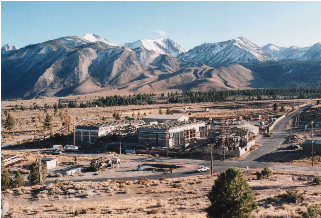
Figure 3. Mammoth Pacific L.P.'s geothermal power production plant near Mammoth Lakes, California where silica extraction R&D is currently being carried out.

Current work is underway to extract silica at the Mammoth Lakes, California geothermal plant (Figure 3), with major R&D sponsorship by the U.S. Department of Energy Geothermal Technologies Program through Lawrence Livermore National Laboratory, the California Energy Commission, and Mammoth Pacific L.P. The geothermal fluid at Mammoth has one of the lowest salinities of any geothermal fluid (1200 ppm TDS), with very low calcium, and negligible iron and other metals content. For this reason, the co-produced silica is of very high purity, and therefore may be useful in markets where high purity is necessary, such as colloidal silica for silicon chip polishing.