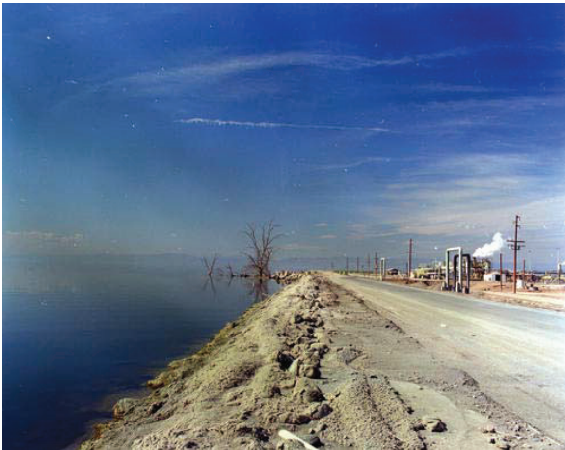
Figure 2. CalEnergy's geothermal power production facility near shore of Salton Sea in the Imperial Valley of southern California.

Silica must be removed from the fluid for the zinc extraction process to be successful. If not, the ion exchange resins are quickly covered by silica precipitates and fail to efficiently extract zinc. The silica is currently removed upstream using a clarification process that combines lime addition and silica seeding. The pH increase accompanying lime addition accelerates silica polymerization, and silica seeds enhance precipitation. The silica is removed by flocculant-aided settling. The silica precipitated with this method has significant amounts of contaminants such as iron and calcium that make it unsuitable for many silica markets for which high purity is needed. Tests showed that it had some favorable properties for use as a cement additive. Currently the silica is being disposed of in a nearby landfill.