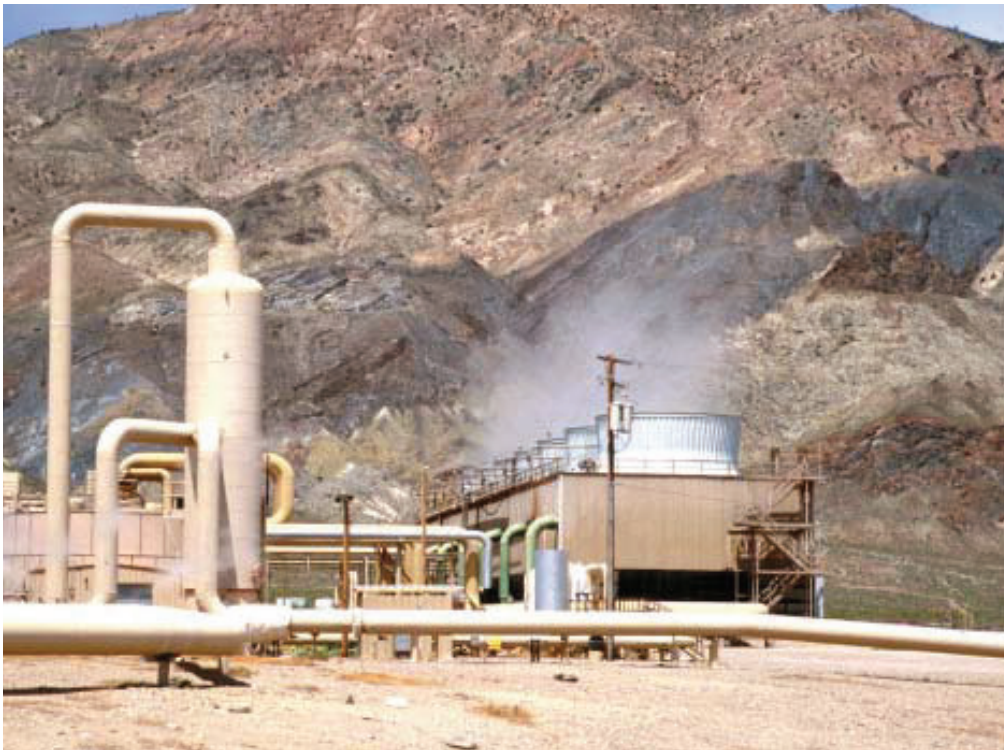
Figure 5. Geothermal power plant at Dixie Valley, Nevada, U.S. where a pilot-scale silica extraction process is in operation.

An economic analysis of silica production at the Dixie Valley geothermal site indicates the following. Capital costs including equipment and building are about $7.8 million. Annual operating costs including labor, power and chemicals are estimated at $3.1 million for a 6,000 ton/year plant. Annual sales at $0.60/lb would yield $7.2 million in sales. After amortization costs, the yield from this project would be equivalent to $0.0094 per kWh produced. In addition, the savings from scale reduction are estimated to be $0.0015 per kWh in terms of annual maintenance and repairs. The total benefit of silica production is equivalent to $0.011 per kWh (1.1 cents/kWh). The pay back period will be less than 3 years based on a 10% interest rate. Market analysis (Moskovitz, 2002) assumes that this is a base case model and that silica sales would far exceed this estimate.