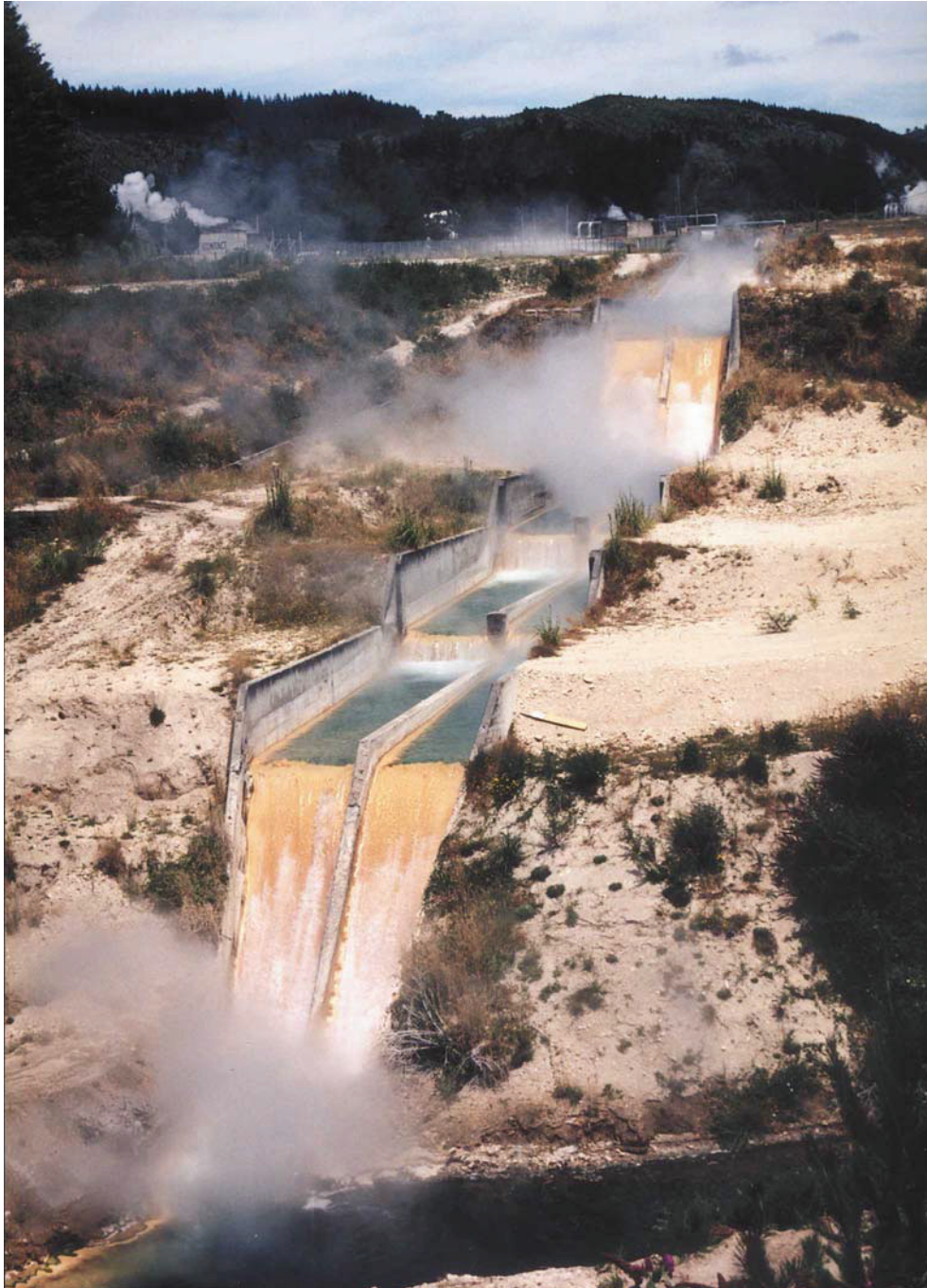
Figure 1. Geothermal fluid drain at Wairakei, New Zealand geothermal site. Silica precipitates of orange-brown color line the channels. A bluish color indicates the presence of colloidal silica in the water.

round of nuclei formation and a bimodal colloid size distribution. Monodisperse silica colloids – colloids having a narrow size range - are more valuable.