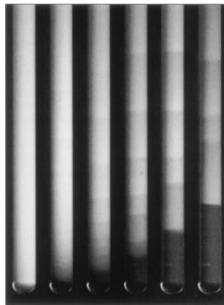
FIG. 1. Images of a 12 mm inner diameter vertical tube of emulsion evolving over time. Visible intensity steps in the rightmost photographs indicate steps in decane droplet concentration, with brighter regions having higher concentration. From left to right, photos were taken after 0, 51, 73, 100, 137, and 175 h of creaming.

where a is the radius of the droplet, \Delta \rho is the density mismatch between the sphere and the fluid ( \rho_{\text{decane}} - \rho_{\text{water}} = -0.27 \text{ g/cm}^3 ), \nu is the viscosity of the fluid (0.01 P for water), and \vec{g} is the acceleration due to