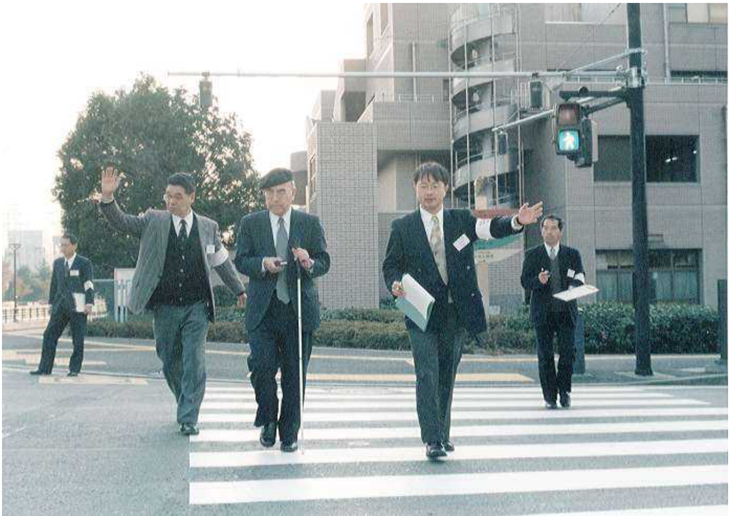
Figure-2 Test Scene-1

As further improvement it is required to: