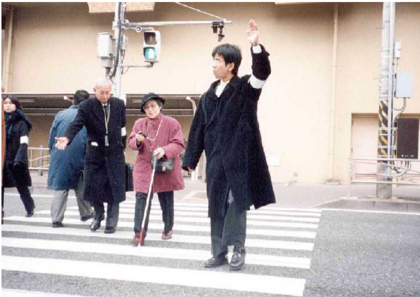
Figure-3 Test Scene-2

PICS-A has been improved to reflect the results of the first field test, "select words carefully for providing much easier voice message" and "provide information till the both end of crosswalk continuously".