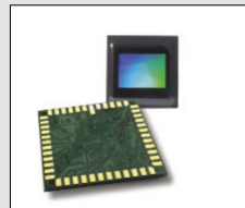
Aptina Imaging Corporation's 10-megapixel complementary metal-oxide semiconductor sensor is the first such device for point-and-shoot cameras.