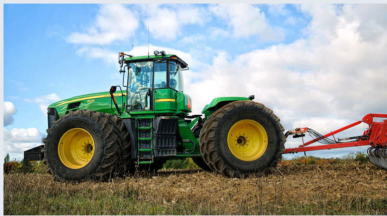
Spinoff 2017: NASA Tech Makes a Difference on Earth