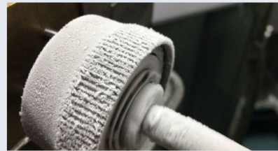
Metallic Glass Gears Make for Graceful Robots