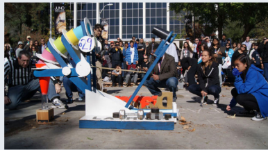
Students Test Their Concepts in JPL Invention Challenge