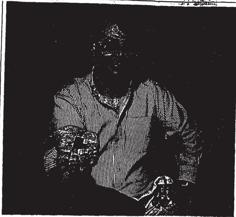
FOSSUM: The project leader and his co-inventors will share in any royalties

Their device, a type of "active pixel sensor," has more in common with a computer chip than with a conventional CCD. Since it's made on standard semiconductor production lines, it taps into enormous economies of scale and should