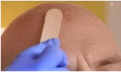
Figure 2: Drug application

Use glove protected fingertips or a spatula to apply AMELUZ. Apply gel approximately 1 mm thick and include approximately 5 mm of the surrounding skin. Use sufficient amount of gel to cover the single lesions or if multiple lesions, the entire area. Application area should not exceed 20 cm 2 and no more than 2 grams of AMELUZ (one tube) should be used at one time. The gel can be applied to healthy skin around the lesions. Avoid application near mucous membranes such as the eyes, nostrils, mouth, and ears (keep a distance of 1 cm from these areas). In case of accidental contact with these areas, thoroughly rinse with water. Allow the gel to dry for approximately 10 minutes before applying occlusive dressing.