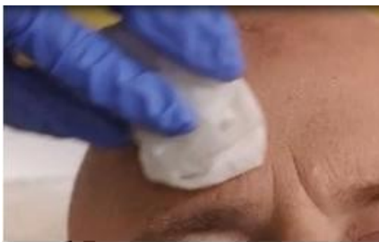
Figure 1A: Degreasing the skin

Before applying AMELUZ, carefully wipe all lesions with an ethanol or isopropanol-soaked cotton pad to ensure degreasing of the skin.