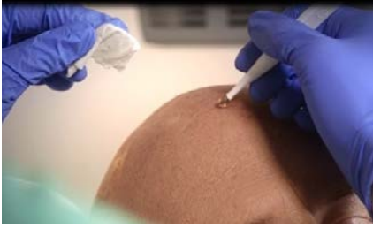
Figure 1B: Removal of scales and crust