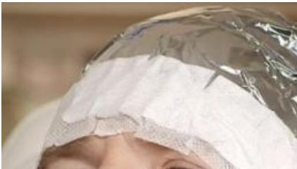
Figure 3: Occlusion

Cover the area where the gel has been applied with a light-blocking, occlusive dressing. Following 3 hours of occlusion, remove the dressing and wipe off any remaining gel.