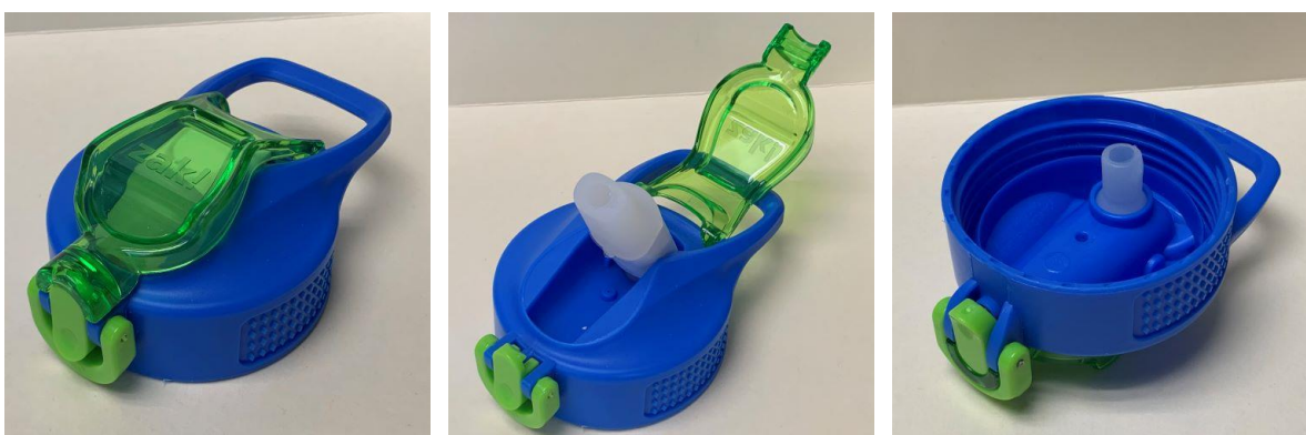
e. Park II