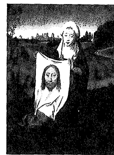
veronica 2 c. 1480 painting by Hans Memling

SYNONYMS: vertical, upright, perpendicular, plumb. These adjectives are compared as they mean being at or approximately at