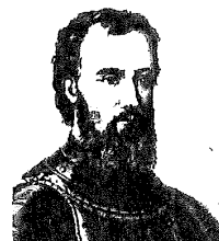
Giovanni da Verrazano