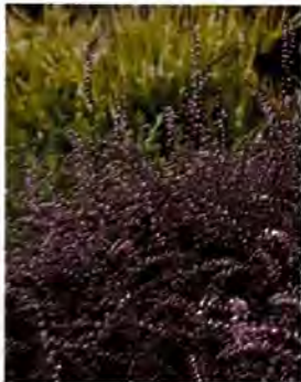
heather Calluna vulgaris