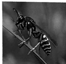
wasp paper wasp

watch-dog (wōch'dōg', -dōg') n. 1. A dog trained to guard people or property. 2. One who serves as a guardian or protector against waste, loss, or illegal practices. — watch/dog' v.