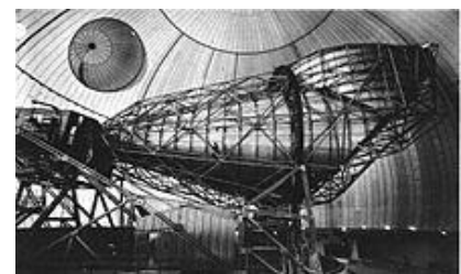
177 ft. horn antenna at AT&T's satellite ground station in Andover, Maine, built to communicate with Telstar

Since the transmitters and receivers on Telstar were not powerful, ground antennas had to be huge. Bell Laboratory engineers designed a large horizontal conical horn antenna with a parabolic reflector at its mouth that re-directed the beam. This particular design had very low sidelobes , and thus made very low receiving system noise temperatures possible. The aperture of the antennas was 3,600 sq ft (330 m 2 ). The antennas were 177 ft (54 m) long and weighed 380 short tons (340,000 kg). Morimi Iwama and Jan Norton of Bell Laboratories were in charge of designing and building the electrical portions of the azimuth-elevation system that steered the antennas. The antennas were housed in radomes the size of a 14-story office building. Two of these antennas were