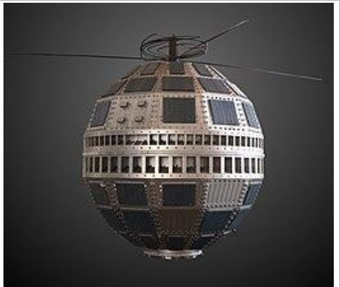
Model of a Telstar satellite, on display at Conservatoire national des arts et métiers