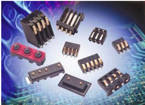
Figure 1. Battery pack connectors come in various sizes and shapes featuring two distinct contact configurations: stamped cantilever contacts for consumer electronic products, and spring-loaded "pogo pins" for industrial applications.

For years, traditional battery pack connectors have been found in applications such as cellular telephones and portable industrial electronic devices. Available in various sizes and shapes, traditional batteries feature two distinct contact configurations (see Fig. 1). Stamped cantilever contacts provide the more economical interconnect for volume consumer electronic level products, whereas spring-loaded "pogo pins" are chosen for industrial applications to provide extended cycle life. In both cases, the same performance requirements found in a compression-style interconnect apply to a majority of the application parameters.