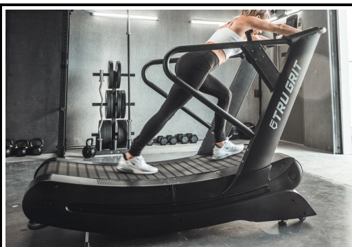
ZERO ELECTRICAL CONSUMPTION