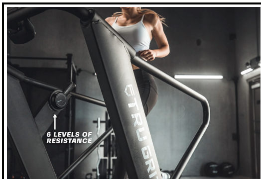
6 LEVELS OF RESISTANCE