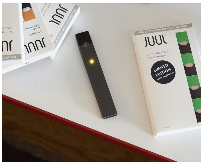
Juul's signature vape and flavored pods.

Juul says its signature brushed-aluminum, thumb-drive-shaped vape is intended to help adult smokers switch to a healthier alternative, and there’s reason to believe it’s making some progress on that front. But it’s also become ubiquitous in America’s schools, prompting a backlash among critics who say it’s hooked a new generation on nicotine . In conjunction with anti-tobacco groups, users have sued the company for allegedly leading them into addiction, a claim the company says is without merit. In June, San Francisco voters banned the sale of flavored tobacco products, which include 75 percent of Juul’s liquid pods. Critics paint the company’s flavors, which include mango, cucumber, and crème brûlée, as dangerous gateway drugs created from little-studied chemicals. The company says they’re the cornerstone of its benevolent mission.