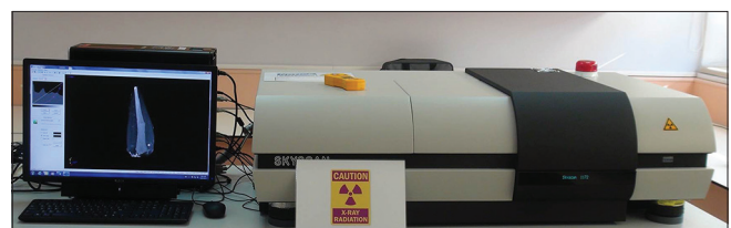
Figure 3: Micro-computed tomography for analysis of mineralized tissues with micro-sized sections

With the use of modern technology at X-ray sources and detectors, MCT devices have 10,000 times more resolution than medical CT scanners do. [61] The system has a micro focus X-ray source, a CCD camera, and a personal computer for control of the system. The X-ray radiation source with focal spot size of 10 mm is used to scan the objects. CCD camera provides high-resolution images. MCT gives important information about wound healing and micro vascular researches in orthopedics. The MCT devices are also used in researches related to endodontics, prosthetics, TMJ, and dental caries. [62,63] Current MCT scanning of bone has revealed accurate and precise information about