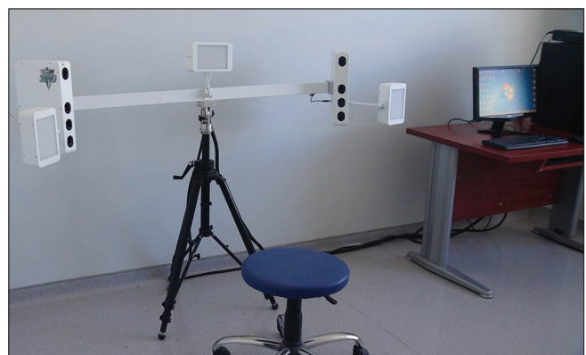
Figure 4: Stereophotogrammetry with 2 different coplanar planes for 3D images

Stereophotogrammetry includes photographing a 3D object from 2 different coplanar planes in order to acquire a 3D reconstruction of the images [Figure 4]. This technique has proven to be very effective in the face display. It mentions to the private case with 2 cameras, arranged as a stereopair, are used to recover 3D distances of features on the surface of the face. [72] The technique has been implemented clinically by using a mobile stereometric camera. [21] Contemporary stereophotogrammetry may be used to clear up accurate 3D skull mapping. In 1944, the