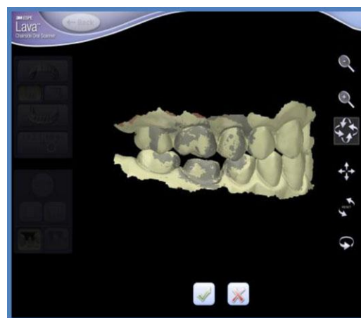
Figure 6 3D image of occlusion.