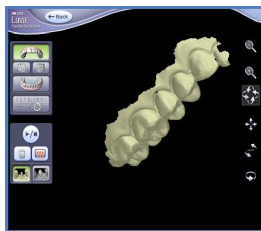
Figure 5 3D image of antagonists.