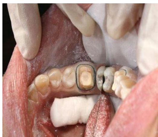
Figure 2 Powder spraying tooth.