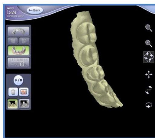
Figure 4 3D image of prepared tooth.