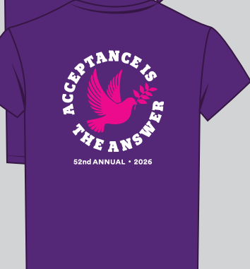
MENS PRE-REGISTRATION T-SHIRT