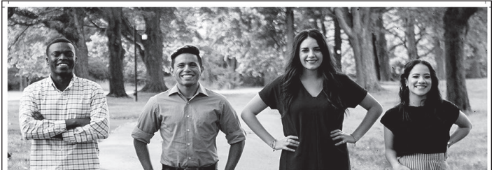
The Evangelization Committee of St Francis Cabrini Presents:

Wednesday, May 8th is date of the next speaker in our series. The speaker is from a group called the CULTURE PROJECT. This is a group of young adults who, as missionaries, go out to Catholic schools and "talk to the students about what Catholic teaching is all about, in today's world." They speak to 8th to 12th grades classes. Come to the church at 6:30 pm to begin with a rosary and stay to hear what these terrific people do to help our young people of today understand the truth.