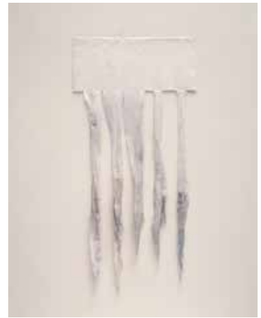
4. Robert Rauschenberg, Untitled , 1974. Embossed paper, solvent transfer, and watercolor on cheesecloth, 50 ½ x 24 ¾ in. (128.3 x 61.4 cm). Solomon R. Guggenheim Museum, New York, gift of the Robert Rauschenberg Foundation; © Robert Rauschenberg Foundation / Licensed by VAGA, New York, NY