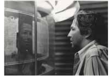
2. Robert Rauschenberg standing in front of the Dead Sea Scrolls in the Shrine of the Book at the Israel Museum, Jerusalem, 1974.