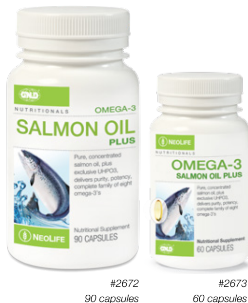
#2672 90 capsules