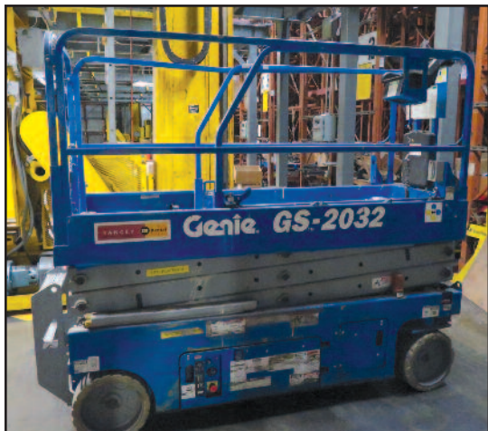
Genie Mod. GS-2032 Electric Scissor Lift