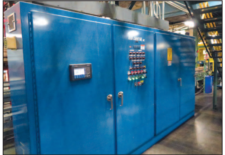
Tech Systems Conveyor Programmer