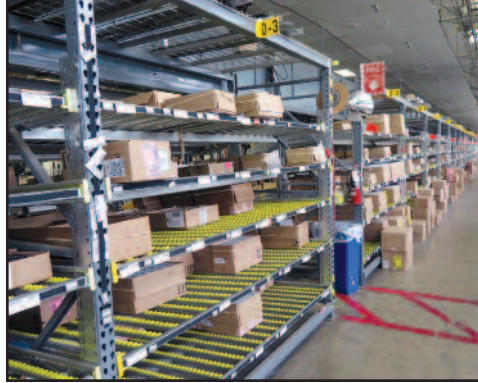
Flow Thru Inventory System