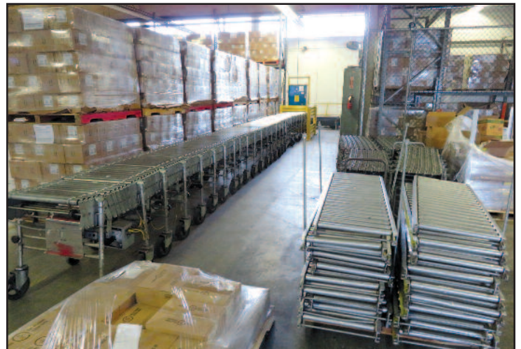
Roller Skate Conveyor