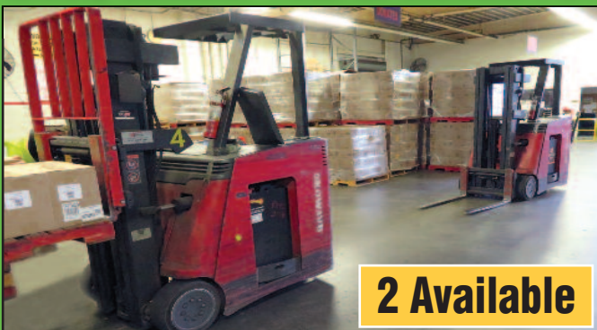
Raymond Mod. DSS300-C30TF, 3000 Lb. Electric Stand-Up Forklifts