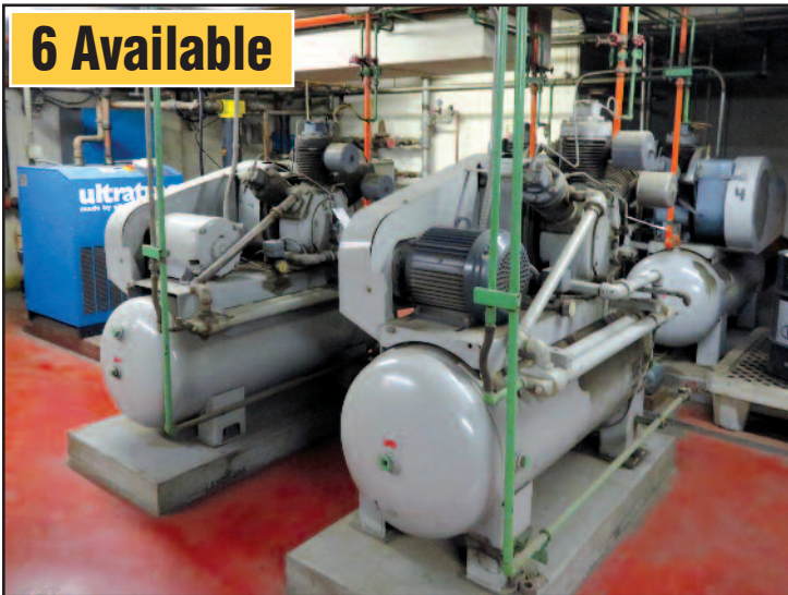
Ingersoll-Rand 15hp Tank-Mounted Air Compressors