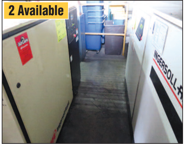
Ingersoll-Rand 60HP Rotary Screw Air Compressor