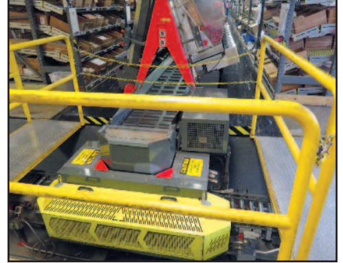
Knapp Box Filling & Transfer System