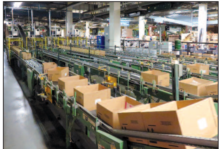
Bushman Inventory Conveyor