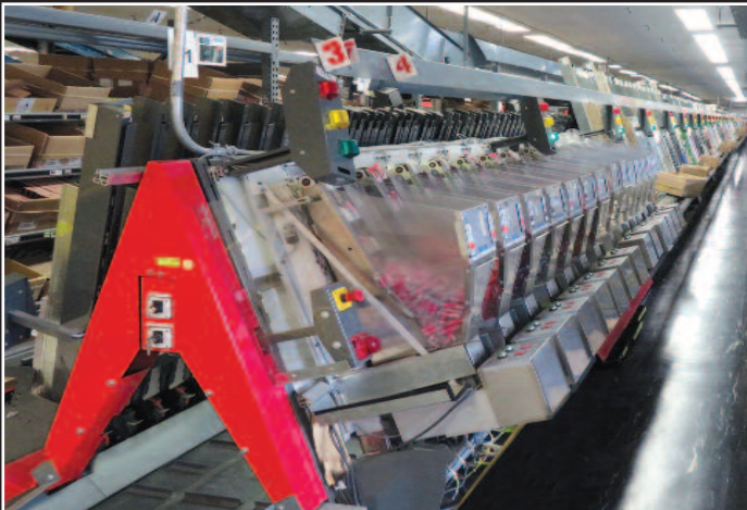
Knapp Automated Assembly & Inventory Dispensing System