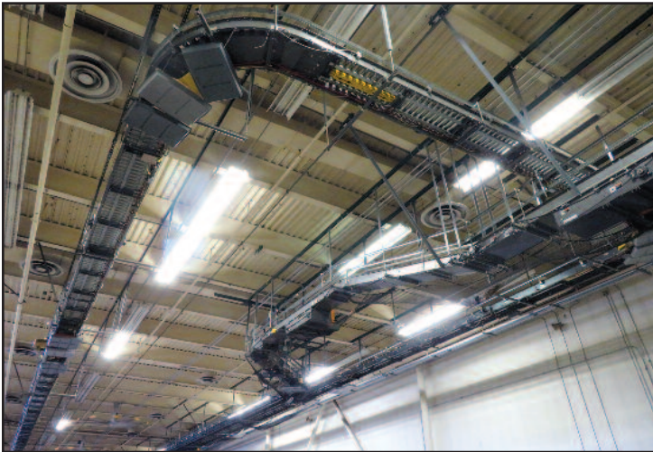
18,000 Linear Feet Bushman & FKI 18”-22” Power Roller & Belt Conveyor

(20) Zebra Label Printers, (4) Southworth Scissor Lifts