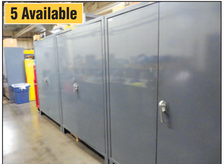
Durham H.D. Storage Cabinets