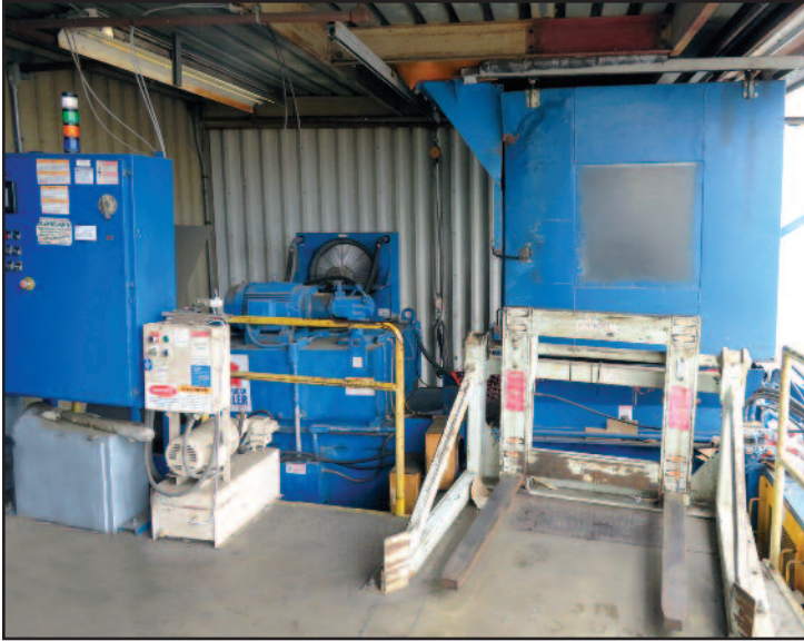
American Mod. DL63438 Auto Horizontal Hydraulic Baler

1997 Ingersoll-Rand SSR-EP60, 60hp Rotary Screw Air Compressor, S/N F18070U97140 2003 Ingersoll-Rand SSR-UP6-40-125, 40hp Rotary Screw Air Compressor, S/N PG0220U03230 (6) Ingersoll-Rand 15hp Tank-Mounted Air Compressors & (2) Air Dryers