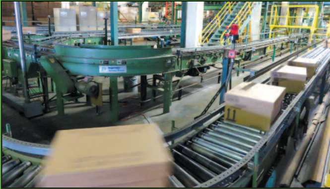
Bushman Power Inventory Transfer Conveyor