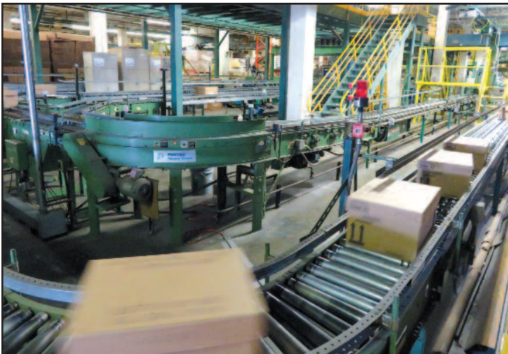
Bushman Power Inventory Transfer Conveyor