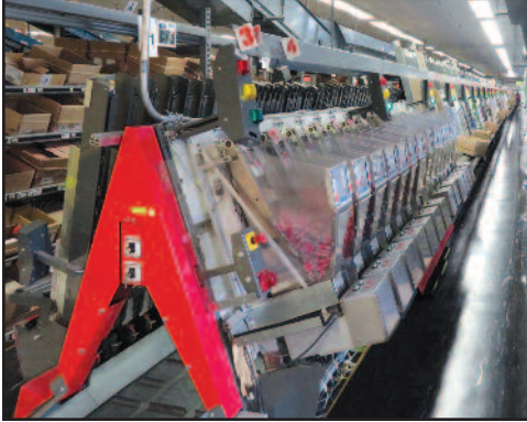
Knapp Automated Assembly & Inventory Dispensing System

Knapp Mod. SSU2000 Multi-Station Inventory Dispensing System – Dual “V” Sided Inventory Flow Conveyor Feeding to Conveyor which is Loaded into Box Loading Transfer Station. Approx 300’ Dual Sided Inventory Flow Racking