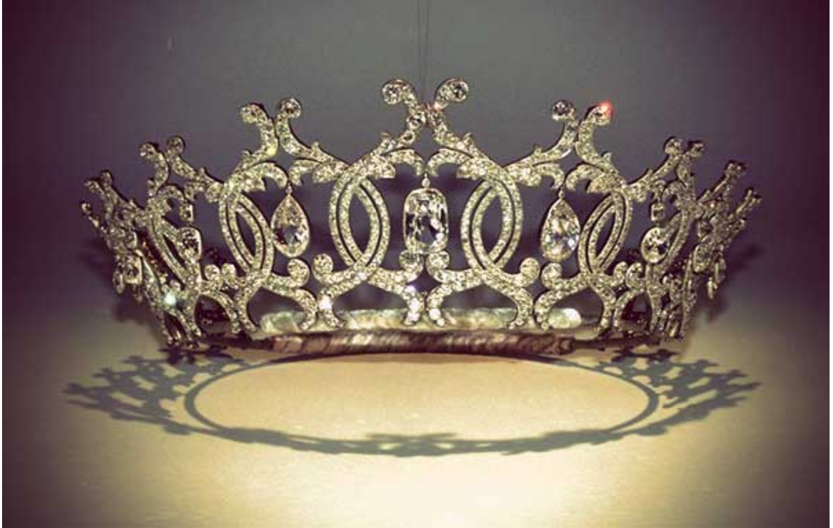
1THE PORTLAND TIARA

stone that was part of the family's collection. You can see it in the center of the tiara here: