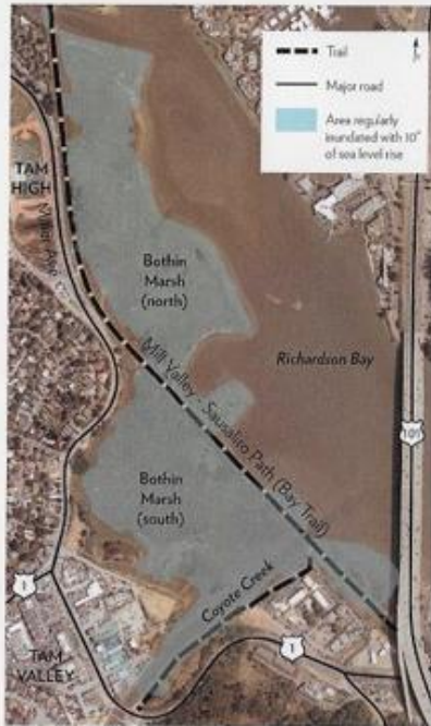
Marin County Parks' 106-acre Bothin Marsh Open Space Preserve hosts a unique mix of wetlands and trails that will be severely affected by the 10 inches of sea level rise predicted in the next 10 years.