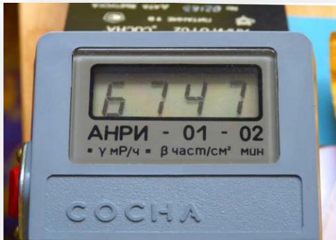
Reading on Empty Box after four hours