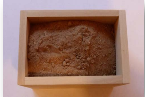
Box filled with Excelerite™