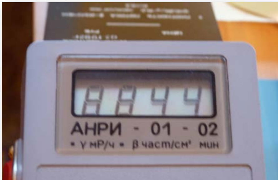
Four hour test results. Approximately one-third higher than the empty box