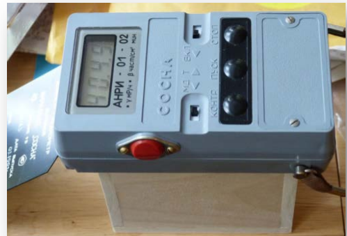
Test with cover open on empty box