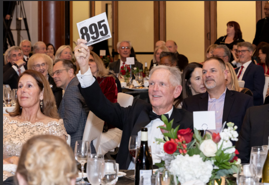
ABOVE: Guests participate in the live auction