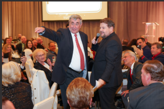
ABOVE: James Corden sparks laughter with guest participation