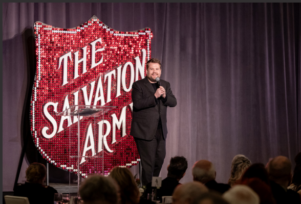
LEFT: Featured entertainer, James Corden, makes his introduction by reminiscing his childhood with The Salvation Army