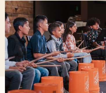
BELOW: Drum performance at the Creative Arts & Music Christmas Celebration