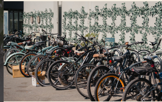
LEFT: Bikes at our newly opened Placentia Navigation Center

*Certain names and photos in this report have been changed for client privacy purposes